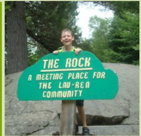
Photos from Camp Lau-ren

Camp Lau-Ren, PO Box 1670 Deep River, ON K0J 1P0